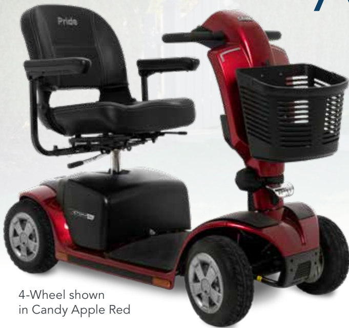
4-Wheel shown in Candy Apple Red