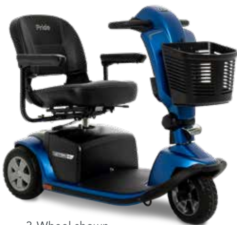
3-Wheel shown in New Ocean Blue